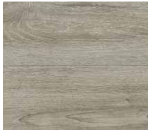
035 Timeless Oak - Grey