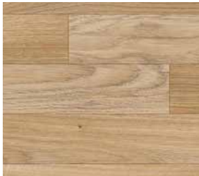
073 Parquet Oak - Natural