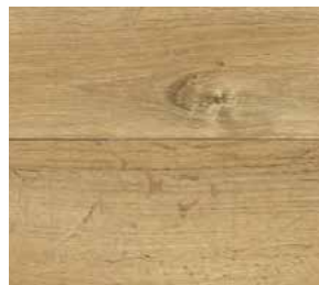
067 Lodge - Middle Natural