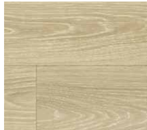
001 Rustic Oak - Natural