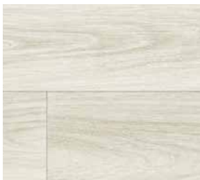
004 Rustic Oak - White