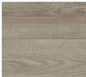
137 Unity Oak - Beige