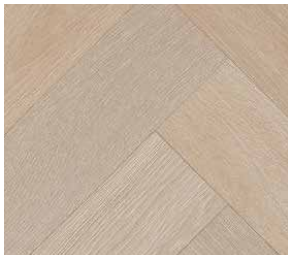
050 Herringbone - Grege