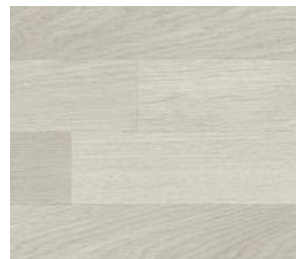
020 Style Oak - Light Grey