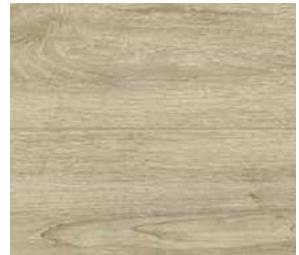
037 Timeless Oak - Natural