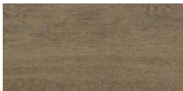
7873 Khaki Timber