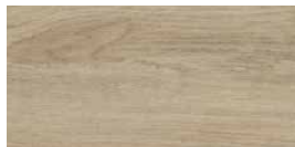
7877 Linen Fiyori Oak