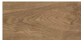
7875 Nice Timber