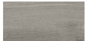
7880 Pewter Oak