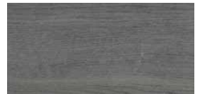
7882 Gris Oak