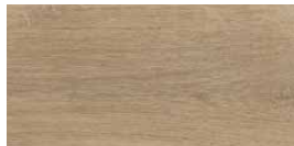
7876 Dusty Beige Oak