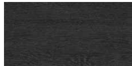
7871 Fumed Timber