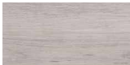
7878 Lime Grey Oak