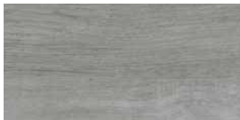
7881 Chateau Fiyori Oak