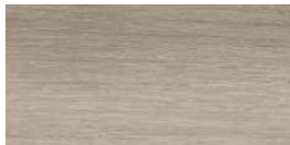
7879 Cream Oak