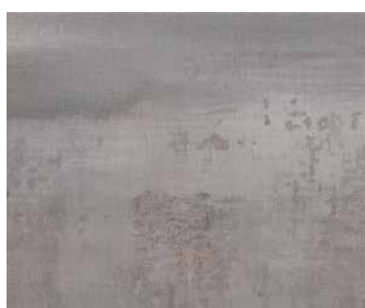
7853 City Scape