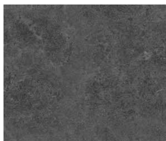
7852 Midnight Marble