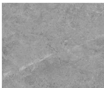
7851 Carrara Marble