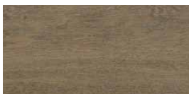
7873 Khaki Timber