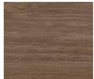
1424 English Mahogany