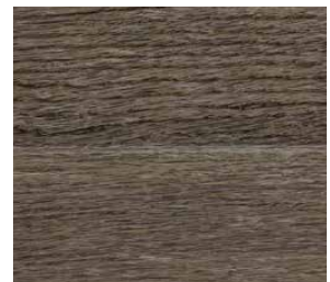
1410 Sawn Grey