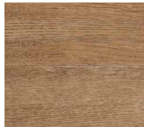
1415 Smoked Oak