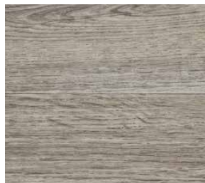
1300 Silver Birch