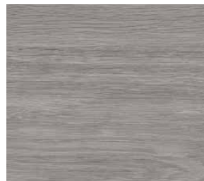
1423 Dali Grey