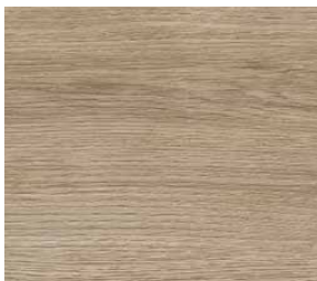
1425 Ridge Oak