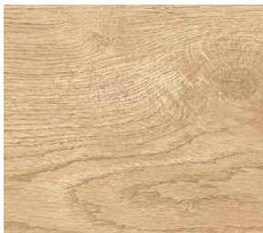
1427 Bourbon Yellow