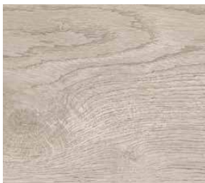
1426 Coade Beige