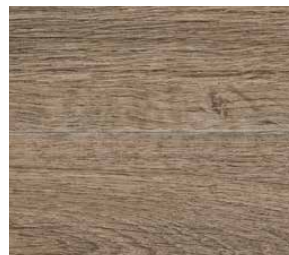
1301 Craft Oak