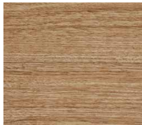
1253 Blonde Walnut