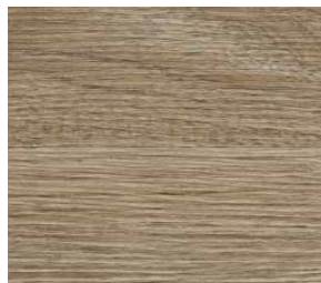
1263 Natural Oak