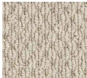
Nash Egg shell