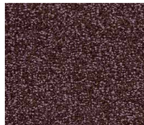
440690 Purple LRV 6