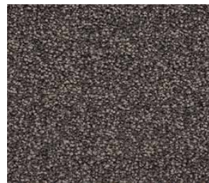
440005 Carbon LRV 10