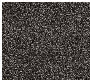
440380 Grey LRV 8