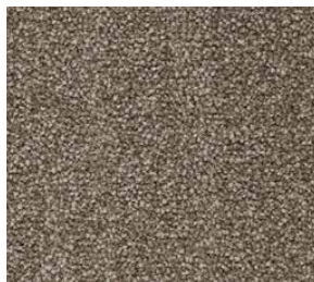
440145 Rhino LRV 13