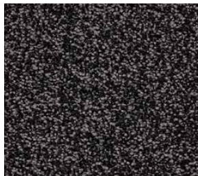
440370 Anthracite LRV 5