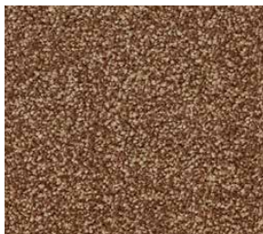
440200 Mocha LRV 15