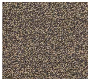
440004 Crumb LRV 13