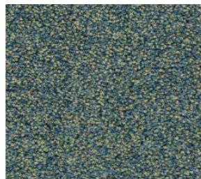
440740 Aqua Marine LRV 10