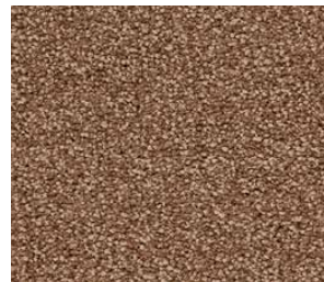
440120 Sand LRV 14