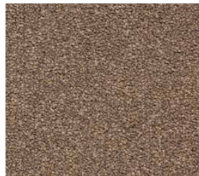
440002 Taupe LRV 18