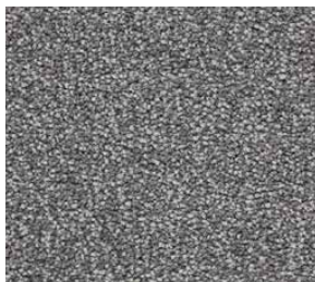
440340 Silver LRV 20