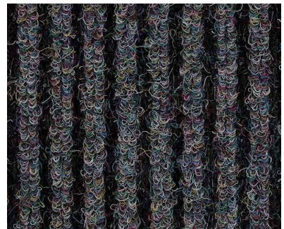
76 Mystic Mir