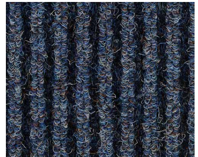
36 Union Blue