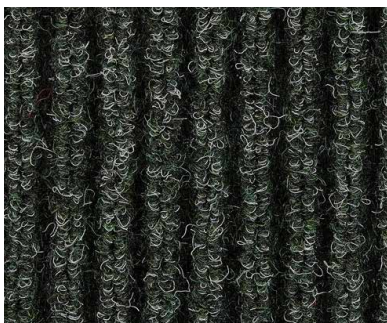
29 Forest Green