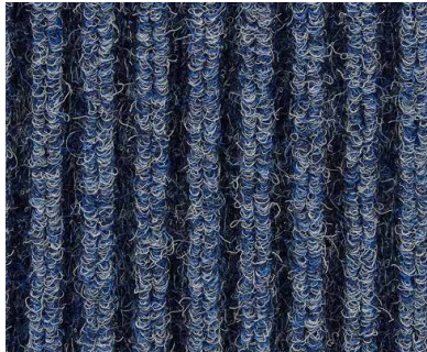
39 Blue Jeans